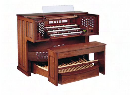
Electronic organ console