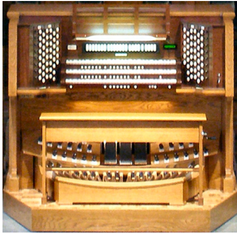
Custom pipe organ console